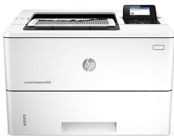
HP LaserJet Enterprise M506n

Finish tasks faster with a printer that starts right away and helps conserve energy. 1 Multi-level device security helps protect from threats 7 . Original HP Toner cartridges with JetIntelligence and this printer produce more high-quality pages. 2