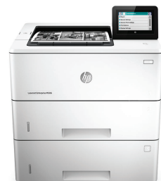
HP LaserJet Enterprise M506x